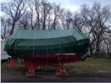
The Lady Pomham waiting for warmer weather.

We now have two boats for use to transport our members out to the lighthouse, our 18 foot Red Boat and our Launch, The Lady Pomham. Since our lighthouse is on an island, it is essential that we maintain good transportation to it. Here are the