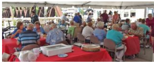
Some of the participants enjoying the BBQ